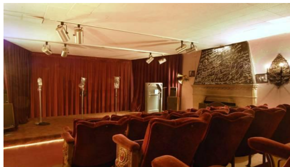
Hudson House Theater, Los Angeles.